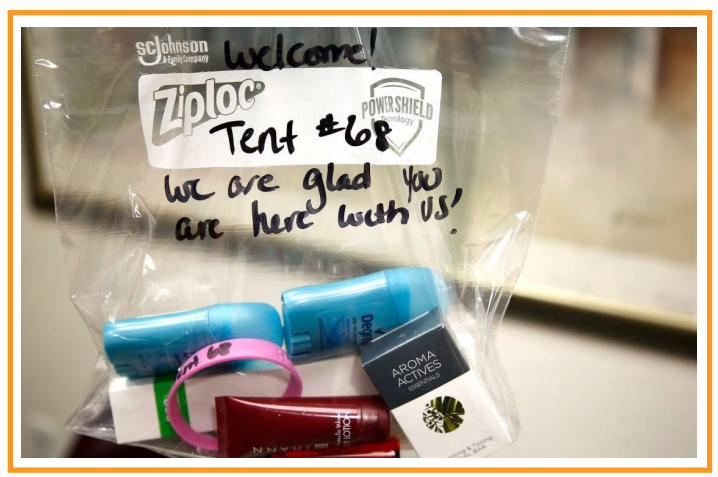
Residents receive Welcome Kit upon arrival.