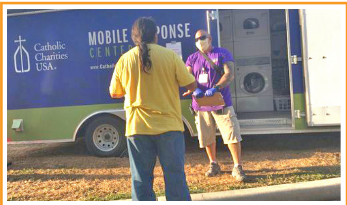
Resident and Staff wait on laundry at Mobile Laundry Trailer.